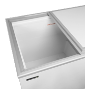
Flat sliding solid lids