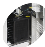
Easy access to clean dust filter