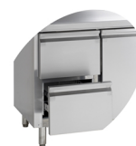
Drawers available as separate kit