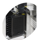
Easy access to clean dust filter