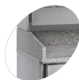
Granite table top