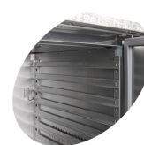
Guides for pizza trays