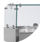
Glass structure for protection of food